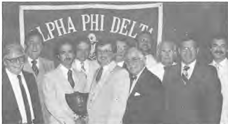
Members of the Pittsburgh Alumni Club gather after the Grand Ball of the 1982 National Convention. At the awards Dinner earlier that evening, they became Alpha Phi Delta's Outstanding Alumni Club for 1982. Pictured in this distinguished group are four Past National Presidents.

Of course, the PAC doesn't just watch sports — they play sports, too. Each year the Bowling Tournament and the Shipley-Valeriano Golf Tournament are held. For the more physically inclined, the brothers break out the old pigskin for the annual Alumni-Undergraduate football game. The younger members of the PAC take on the undergrads with the losers paying for the beer. In the 1982 game, the